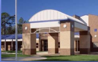
Alachua County Health Department May 19, 2019

Florida Department of Health - Alachua County